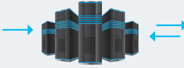
KONFTEL ZTI SERVICE

1 Customer registers the Konftel 300IP/300IPx (MAC address and serial number) in the ZTI portal.